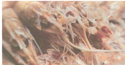
Fresh, chilled langoustine decorate the expediting area where meals are checked before heading to tables.

wedges presented on slightly dampened, cloth napkins allow for a hand-cleaning after plucking at stuffed artichokes or clams and lobsters from their shells.